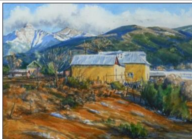
SPRING IN TRUCHAS