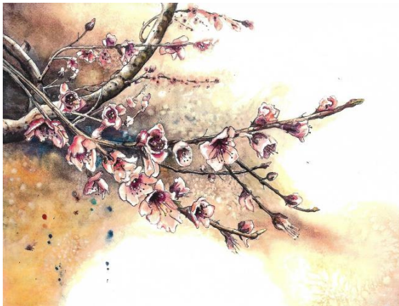
SUMMER'S FIRST CARESS

Get on their website for detailed information on how to enter these shows.