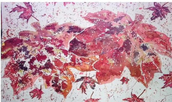
AUTUMN LEAVES OF RED & GOLD